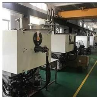
Mold Insection Line