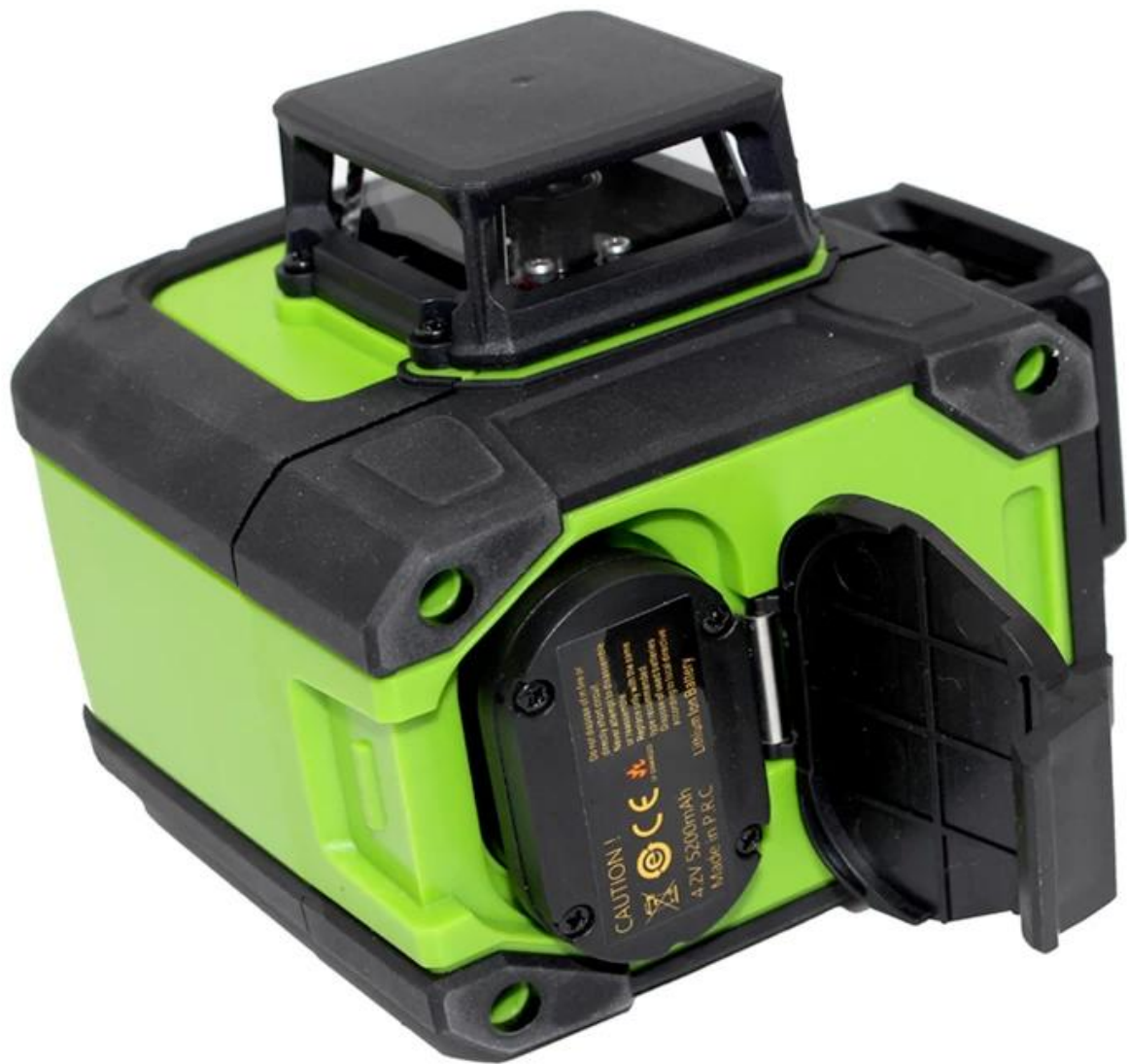
The Li-ion battery