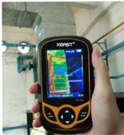
Check exhaust system