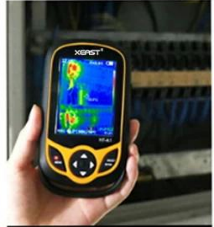
Electric box check