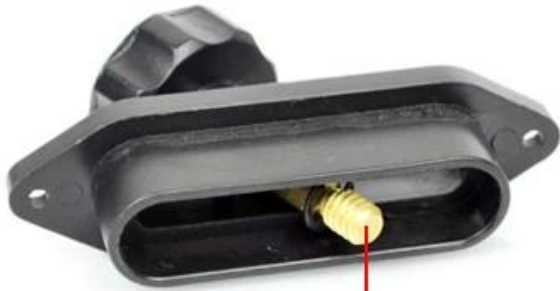
1/4 threaded interface