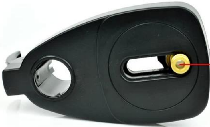
5/8 threaded interface