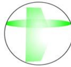
Vertical & horizontal lines