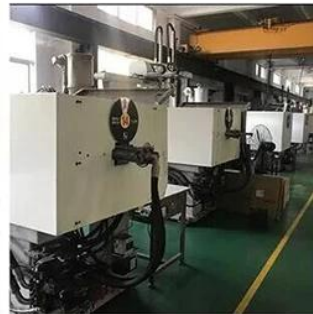
Mold injection Line