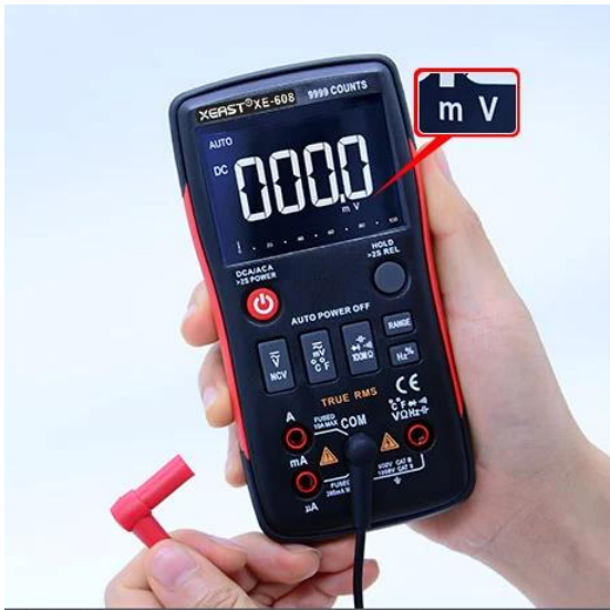
▲ Before inserting the pen