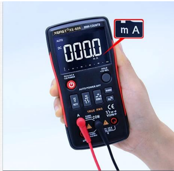
▲ After the insertion of the pen