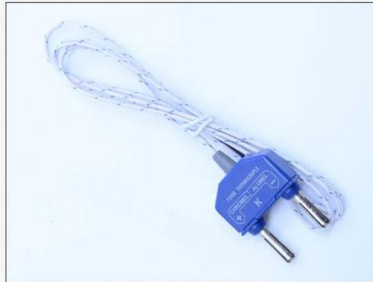
▲ High quality flexible temperature probe